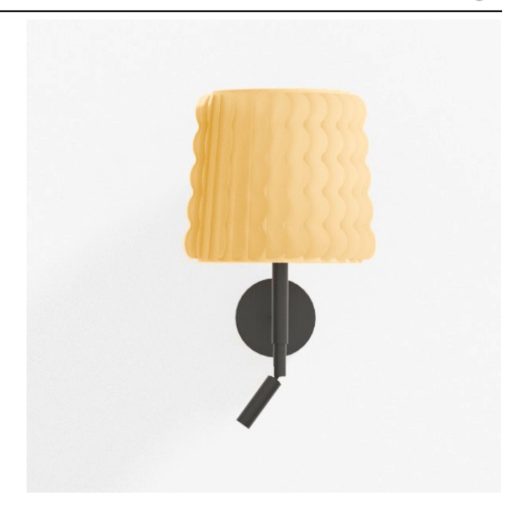
Fabric: Chintz paired pvc fire-proof